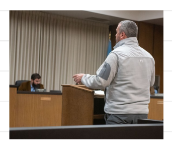
Praying before the Board of Supervisors meeting on December 9th.